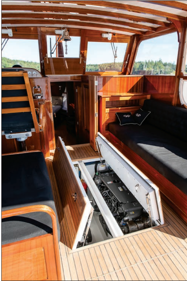
The two Yanmar diesel engines are installed in a compact engineroom below the cockpit sole but with additional service access through the bottoms of the side seats. The 13.5kW Cummins Onan genset is aft of the engines, and farther aft, where Hemingway would have had a large icebox for fish, LEGEND has a Seakeeper roll-dampening unit.