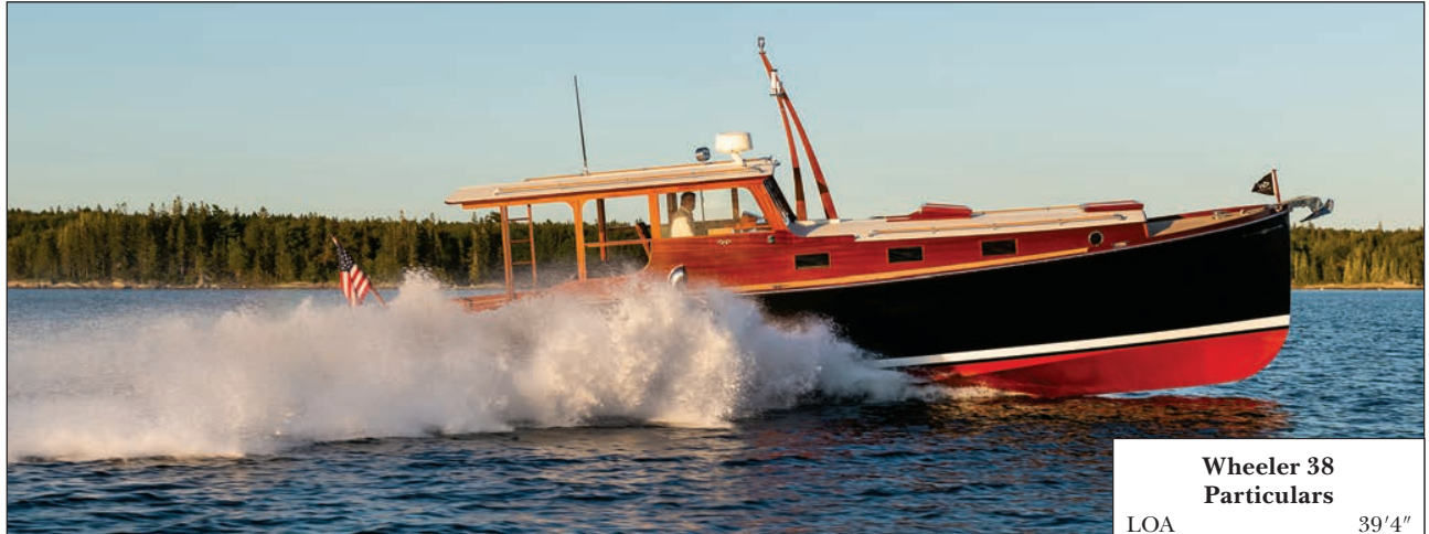
On sea trials, the twin 370-hp Yanmar engines took LEGEND to a top speed of 34.5 mph, which is more than double that of the original boat. PILAR had a single centerline 70-hp Chrysler Crown gasoline engine and an offset 40-hp Lycoming engine for trolling.