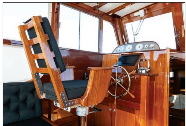
The helm chair takes its ladder-back design from the helm seat and fighting chair on PILAR but is fully adjustable.

Below, the yacht follows the theme of loading the boat with technology but hiding it well. The interior is trimmed with sipo but has a cabin sole of Douglas-fir and Herreshoff-style white painted surfaces and overhead to contrast with the deep-colored bright-finished wood. At the foot of the companionway, the galley is to port and an enclosed head and shower are to starboard. Moving forward, a dining area to port has a table that can be lowered to make a double berth. To starboard, opposite the table, are two custom, built-in easy chairs with a locker between them. Forward, an owner’s